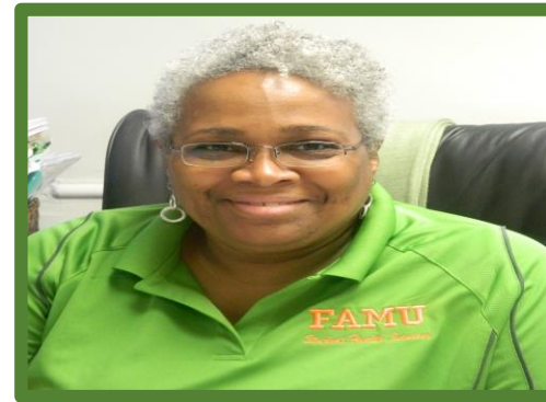
STUDENT HEALTH SERVICES