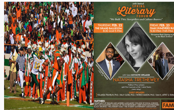
The Arts and History