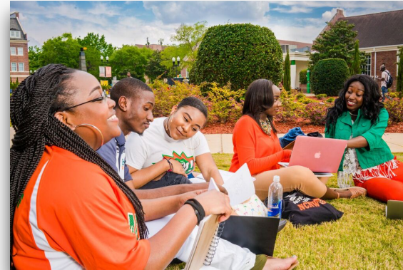
Student Success Initiatives