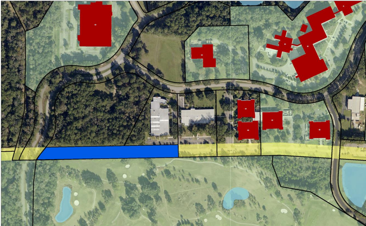
EXHIBIT "B" (Depiction of Parking Lot Location and Existing Drive)

This document and the information contained herein are for informational purposes only and do not constitute an offer of insurance or any other financial product. Florida State University is not a licensed insurance agent and does not provide insurance services. The information contained herein is for informational purposes only and should not be used as a basis for any investment or financial decision. The information contained herein is for informational purposes only and should not be used as a basis for any investment or financial decision. For an authoritative source of information about legal and financial services, please contact your attorney or financial advisor.